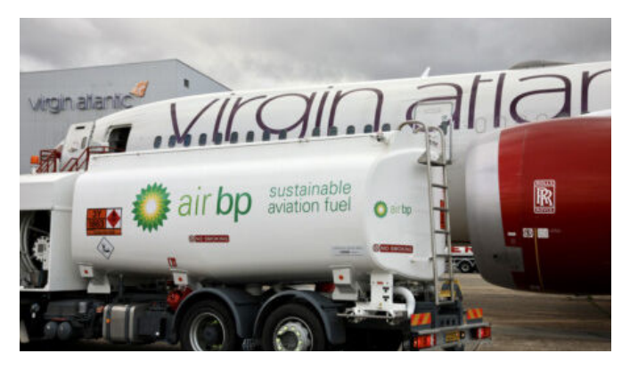
Virgin Atlantic Flies World's first 100% Sustainable Aviation Fuel flight to New York JFK

eFuels Leader Infinium Receives $75 Million Equity Commitment from Breakthrough Energy Catalyst for Investment in Project Roadrunner